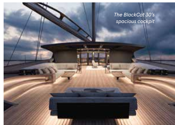
The BlackCat 30's spacious cockpit