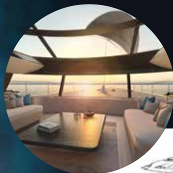
The kite lounge (inset) on board ICE Kite

Red Yacht Design has teamed up with Dykstra Naval Architects to reveal two new designs: the 64.2-metre ICE Kite and its 28-metre shadow vessel ICE Ghost. The owner's brief for ICE Kite was to "create a yacht that feels like she is an integral part of the sea, inspired by sea animals". ICE Kite has accommodation for 10 guests, as well as a swimming pool and helipad. Inside is the kite lounge, specifically designed for watching the yacht's kite in action, which also functions as a dining room. ICE Ghost will carry a range of toys and tenders including an Icon A5 aeroplane, a U-Boat Worx Super Yacht Sub 3 and a 12-metre custom RIB also designed by Red, with a top speed of 60 knots.